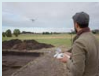
Nicolò Dell'Unto, Dept. of Archeology 3D GIS: Development of new research methodologies for the documentation and analysis of archeological sites.

Geographic Information Systems (GIS) and 3D acquisition technology open up novel documentation methodologies in archaeology. With sophisticated database management systems (GIS) and accurate 3D replicas of a site, at different steps of its investigation, archaeologists can now map the metamorphosis that characterizes any archaeological investigation, preserving the material information virtually which would otherwise permanently be removed during the field activities. This project studies how the combination of 3D models and 3D geographic systems can be employed to generate accurate interpretations of the past, by providing archaeologists and cultural heritage specialists with an opportunity to simulate past scenarios while keeping accuracy of details.